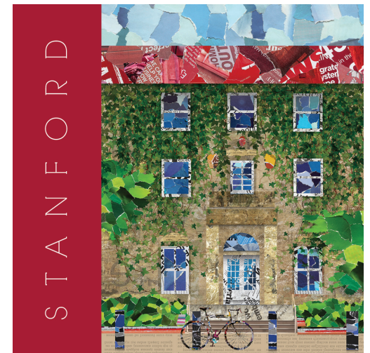
ART: ROBLE HALL